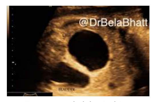
Figure 4: Fetal Abdominal Cyst