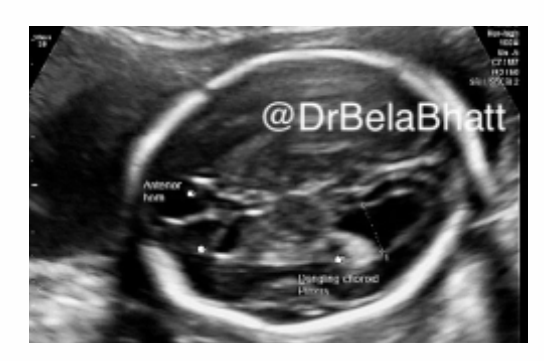
Figure 1: Mild Ventriculomegaly

Let's be vigilant in doing late 2nd& 3rd trimester scans as they are not just the growth scans but also anomaly scans. And by picking them up antenatally we can improve overall perinatal outcome.