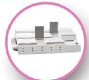
Dry Incubator K System G185