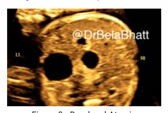
Figure 3 : Duodenal Atresia