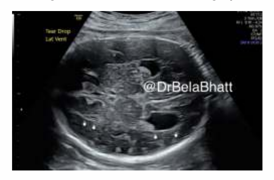
Figure 2: Absent Corpus Callosum