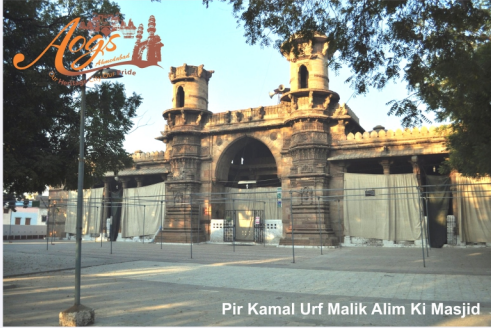
Pir Kamal Urf Malik Alim Ki Masjid