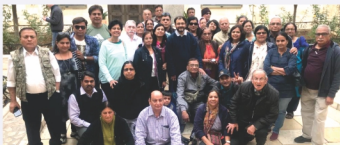
Face of Confidence Walkathon Date : 02.12.2018