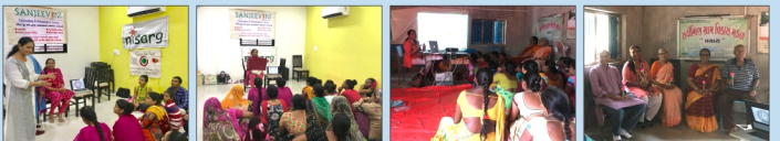
Date : 24.05.19 - Session on Menstrual Hygiene (AOGS Logo on Laptop)