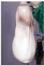
Intact Specimen Removed