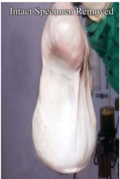
Intact Specimen Removed