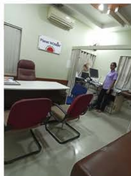
Consultation office 2