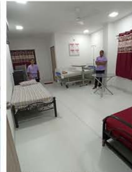
Super Delux Room