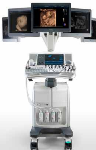
Dc-8 Diagnostic Ultrasound System