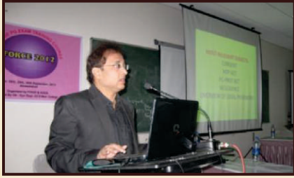
Force 2012 @ GCS Medical College An Absorbing Academic treat for PG Students