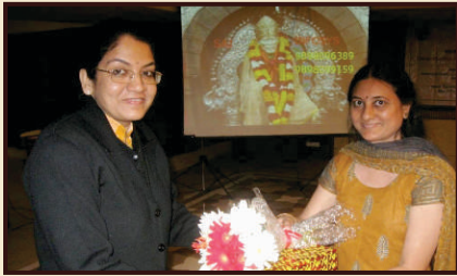
Comprehensive Abortion Care 25 th Nov 2012