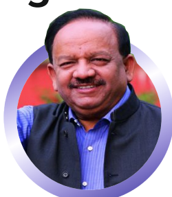
Dr. Harsh Vardhan Hon. Minister of Health, Family Welfare, GOI